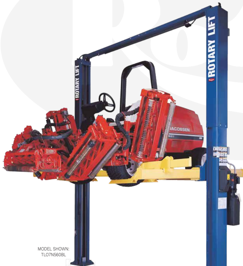
MODEL SHOWN: TLO7N560BL

7,000 lbs. CAPACITY / MOWER SERVICE LIFTS